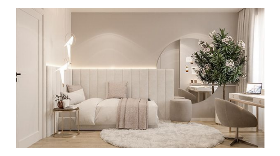
98000 L.E Children's bed, puff, desk, chair and mirror